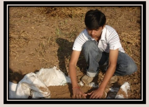
Volunteer collecting Soil Sample