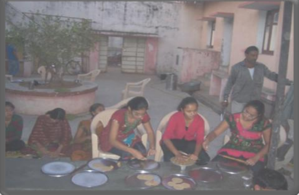
Volunteers preparing Evening Meal