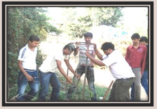
Tree Plantation in Village