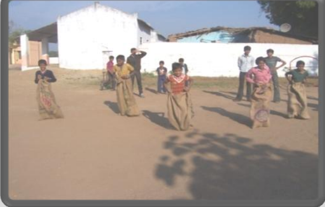
Participation in school games